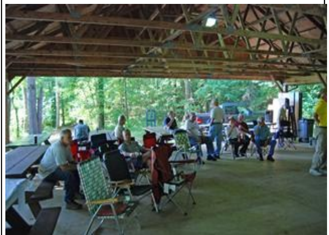
Waiting for the fun to begin.