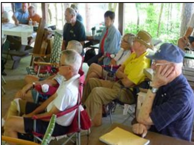
What a nice crowd.