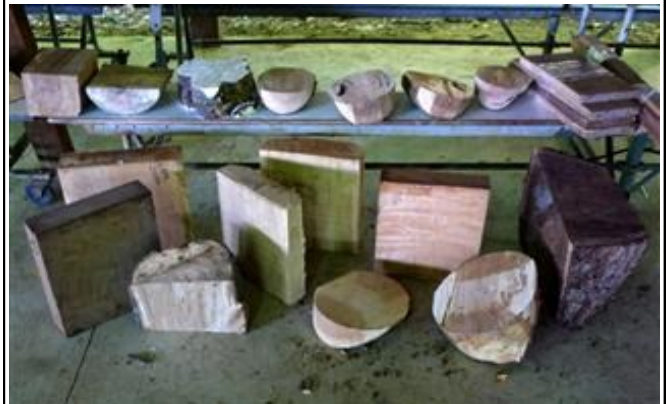
Wood blanks anyone?