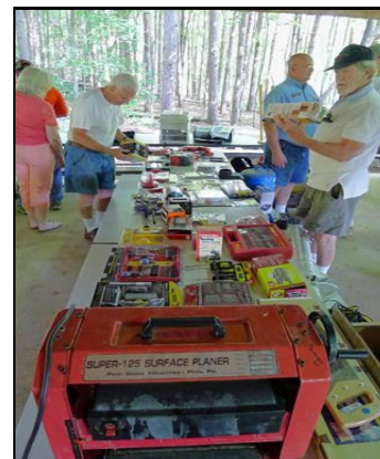
Tools from Hartville Hardware.