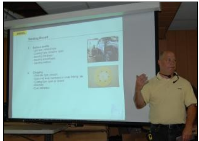
The club used the new video equipment to enhance this presentation.

He also stated that Merlon is a Scotchbrite type of non woven abrasive that is very good for polishing the wood surface of woodturned bowls. The maroon pads are usually used for buffing off sanding sealer while the gray material is used between coats of finish for a better surface preparation. Abralon, is in a disc format with a cushion or padded foam backing. It usually is sold in retail outlets in 180 grit and up to 4000 grit. The main thrust of the Mirka line of sanding applications is that they will last longer than regular sandpaper and do a much better job of preparing the wood for finish application.