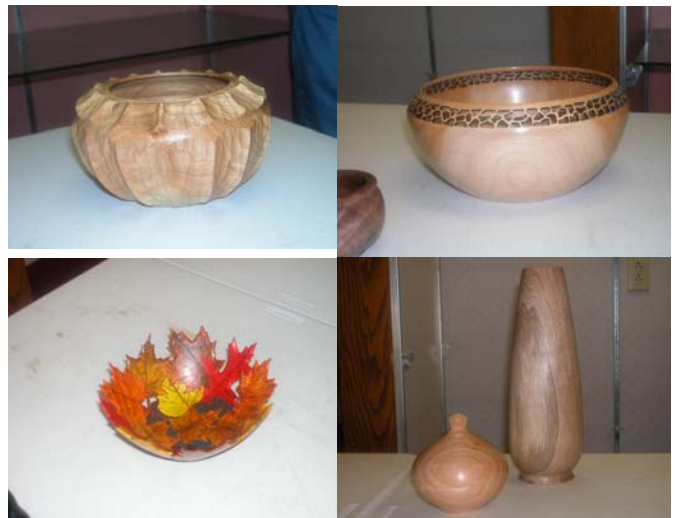
Photos from the August meeting show and tell table.